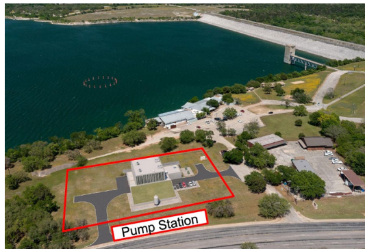
Architect rendering of proposed water intake facility at Lake Belton (facing north).

In 2005, the BRA authorized additional water supply contracts from Lakes Belton and Stillhouse Hollow to meet future demands in Bell, Burnet, Milam, Williamson, Coryell, and Lampasas counties. To meet these demands during times of drought, a raw water transfer system is required to manage this portion of the water supply system to ensure water can be accessed when and where it is needed.